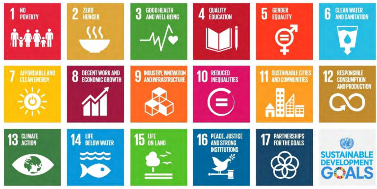
Figure 1. The Sustainable Development Goals (SDGs)

The UN Statistical Commission has initiated a process for developing the global indicator framework for the 17 SDGs and 169 targets. The Commission endorsed a preliminary set of 231 indicators (UN 2016) based on the work of the Inter-Agency and Expert Group on SDG (IAEG-SDGs). The IAEG-SDGs Indicators subsequently divided these indicators into three tiers (IAEG-SDGs 2016, as of March 2016): Tier I comprises 98 indicators (40%) for which statistical methodologies are agreed and global data are regularly available; 50 indicators (21%) are Tier II with clear statistical methodologies, but little available data; and 78 indicators (32%) fall into Tier III (no agreed standards or methodology and no data). Another 15 indicators have yet to be assigned to a tier.